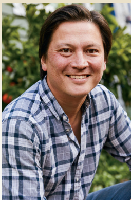
J. KENJI LÓPEZ-ALT